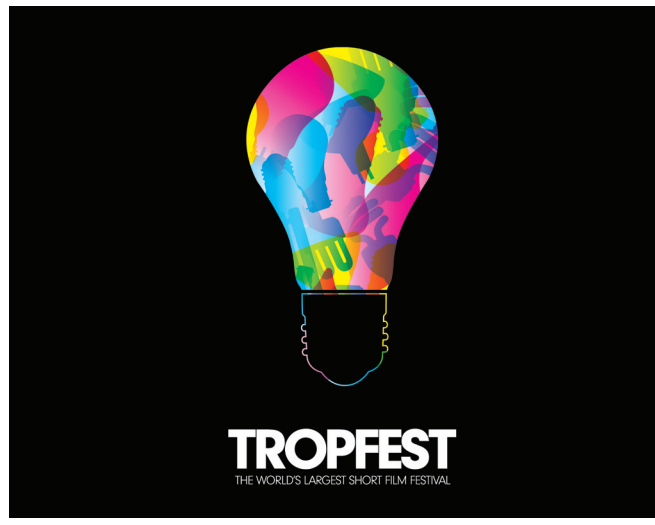
9pm, 15 July 2012 Quarry Park, Penang Botanic Garden

A team of Malaysian academics and performers present their unique version of the world-famous adventures of the four young Athenian lovers and six amateur actors manipulated by forest fairies on a midsummer night.