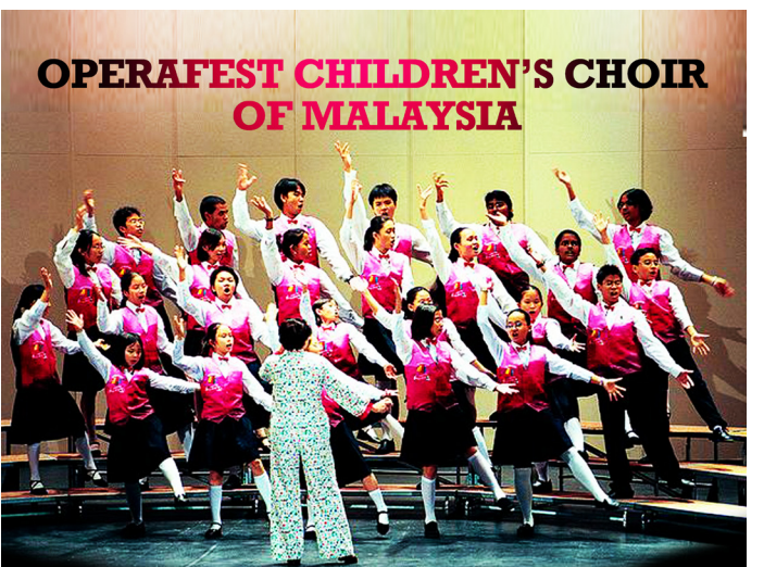
Ticket prices: RM23, RM43 8pm, 30 June 2012 MPPP Town Hall

Back for the second time with George Town Festival following last year's success, Pro Musica Operatic Gala Concert features four outstanding international performers sharing the stage with participants of the opera workshops held as part of the festival