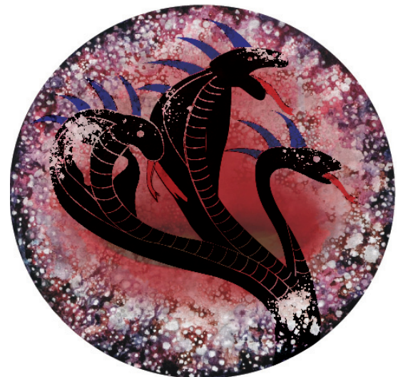
A Midsummer Night's Dream 8pm, 10 - 12 July 2012 Penang Performing Arts Centre

Hailed as one of the biggest new music talents in Britain by Vogue, Soumik Datta collaborates with Austrian drummer Bernhard Schimpelsberger, taking you on a breathtaking audio-visual performance that surpasses cultural borders to find a united language in music.