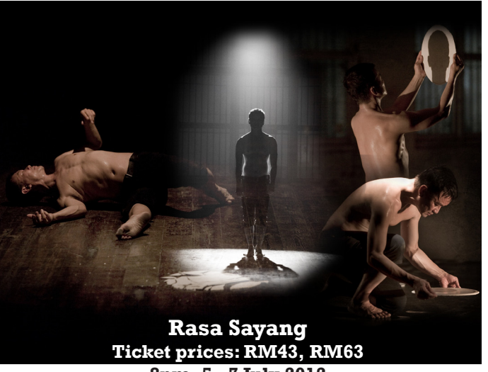
8pm, 5 - 7 July 2012 Penang Performing Arts Centre

LIVE HERITAGE is one of the main highlights of the GTF2012 month of cultural celebrations to mark the anniversary of its 2008 UNESCO World Heritage award. Malaysian performing arts are a complex mosaic of theatre, music and dance, resulting from the meeting and merging of different cultures throughout its history. For the first time, this year's festival includes traditional and endangered performing arts from other UNESCO-listed sites from the ASEAN region and beyond. Known for centuries as a melting pot of ethnicities, cultures and customs, George Town is becoming the premier venue for showcasing these marvelous and threatened art forms.