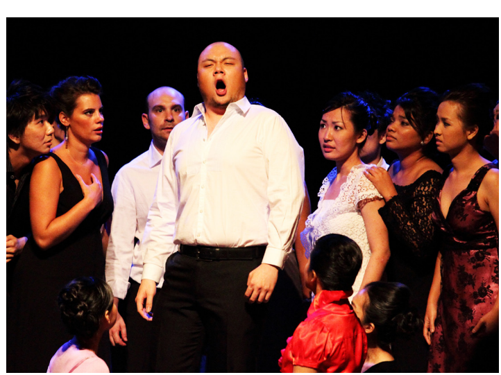
Pro Musica - Mini Concert Ticket prices: RM23, RM43 8pm, 24 June 2012 MPPP Town Hall

Earlier this year, some of Malaysia's most accomplished and motivated rappers, street artists and beat boxers were chosen to take part in an intensive performance-focused HIP HOP WORKSHOP culminating in a free HIP HOP SHOWDOWN. The YES (Youth Excellence on Stage) Academy, with the United States Embassy, has been helping teenagers and young adults from over 100 nations develop their talents and creativity in the performing arts.