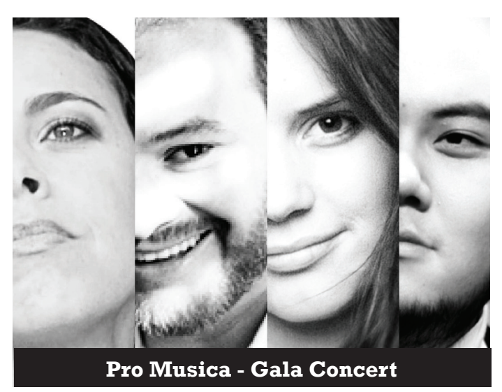
Ticket prices: RM43, RM63, RM83, RM103 8pm, 27 June 2012 Dewan Sri Pinang

Freshly groomed by Masters of the Opera world. participants of the Pro Musica Master class will showcase their talents with a power packed solo performance.